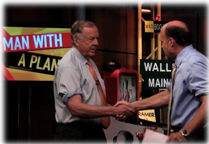
T. Boone Pickens on 'Mad Money' with Jim Cramer

For the past two years, oil prices have been dropping threatening the oil and gas industry. During the lows, landmen may become depressed and even overwhelmed like the Jedi in Disney's latest film, "Star Wars-The Force Awakens," when the galaxy was threatened. Totaland's goal is to equip and empower landmen, like the Jedi were empowered to win. Strengthening landmen during the economic downturn will equip them to succeed in the upswing.